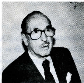
A FOREIGN AFFAIRS LETTER