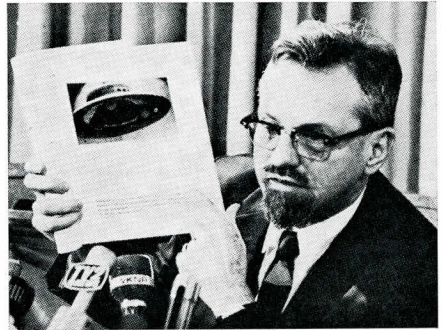
Dr. Hynek, asked at news conference to comment on photo of this "flying saucer," said it looked like a "chicken feeder." Photo was represented as UFO seen over California.

Throughout history, one can see how pioneers have had to face ridicule to achieve their purpose, in defiance of all the conventional fuddy-duddies of