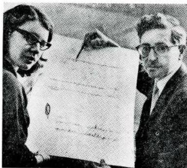
Miss Jocelyn Bell and Dr. Anthony Hewish examine chart of the space signals. Miss Bell, of the Mullard Radio Astronomy Observatory, Cambridge University, England, was the first to notice the strangely regular pattern of the signals from space.