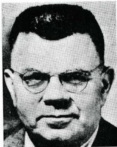
Dr. Edward U. Condon, Head of the University of Colorado UFO Study.